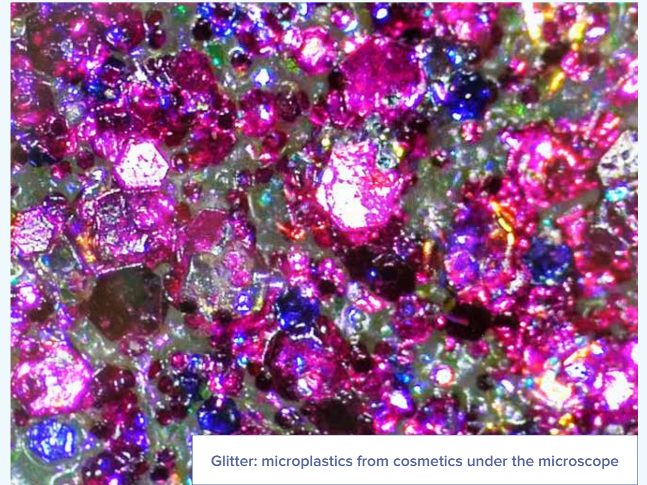
Glitter: microplastics from cosmetics under the microscope

The outdoor clothing industry was the most responsive. Instead, the cosmetic industry revealed to be rather unresponsive and reluctant, preferring to wait for the drawing up of a final legislative framework by the European Chemicals Agency (ECHA).