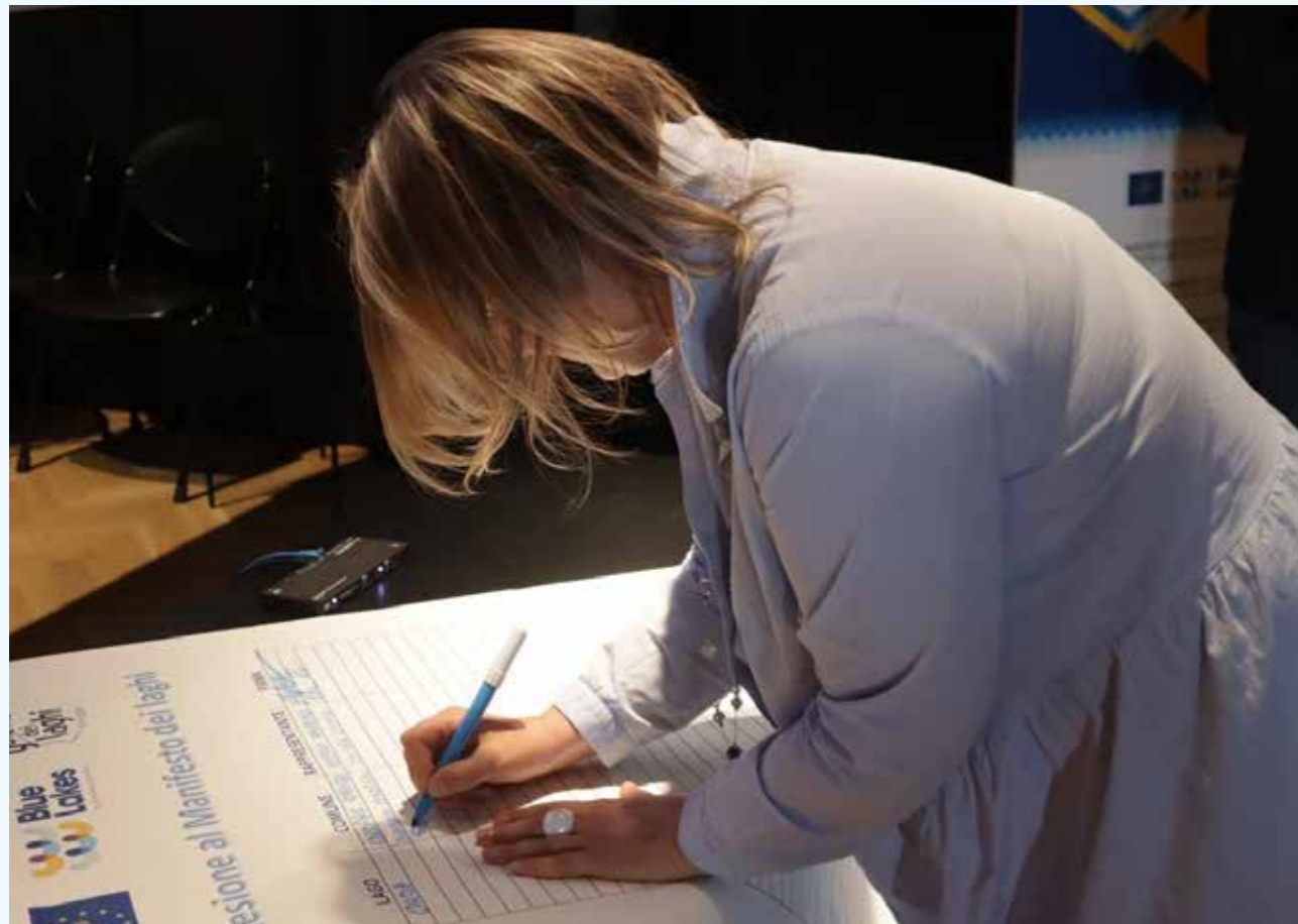
Lake Paper and Manifesto: a guideline for municipalities and stakeholders

Legambiente, the global network of Living Lakes and the newly set up ELLA (European Living Lakes Association) have widely promoted the Lakes Manifesto, attracting subjects from all sectors of society (government, civil society, the academic world and businesses) and fostering a debate that has led to the adoption of the Lakes Paper by 78 stakeholders, including 13 municipalities, while the Manifesto was adopted by 27 municipalities.