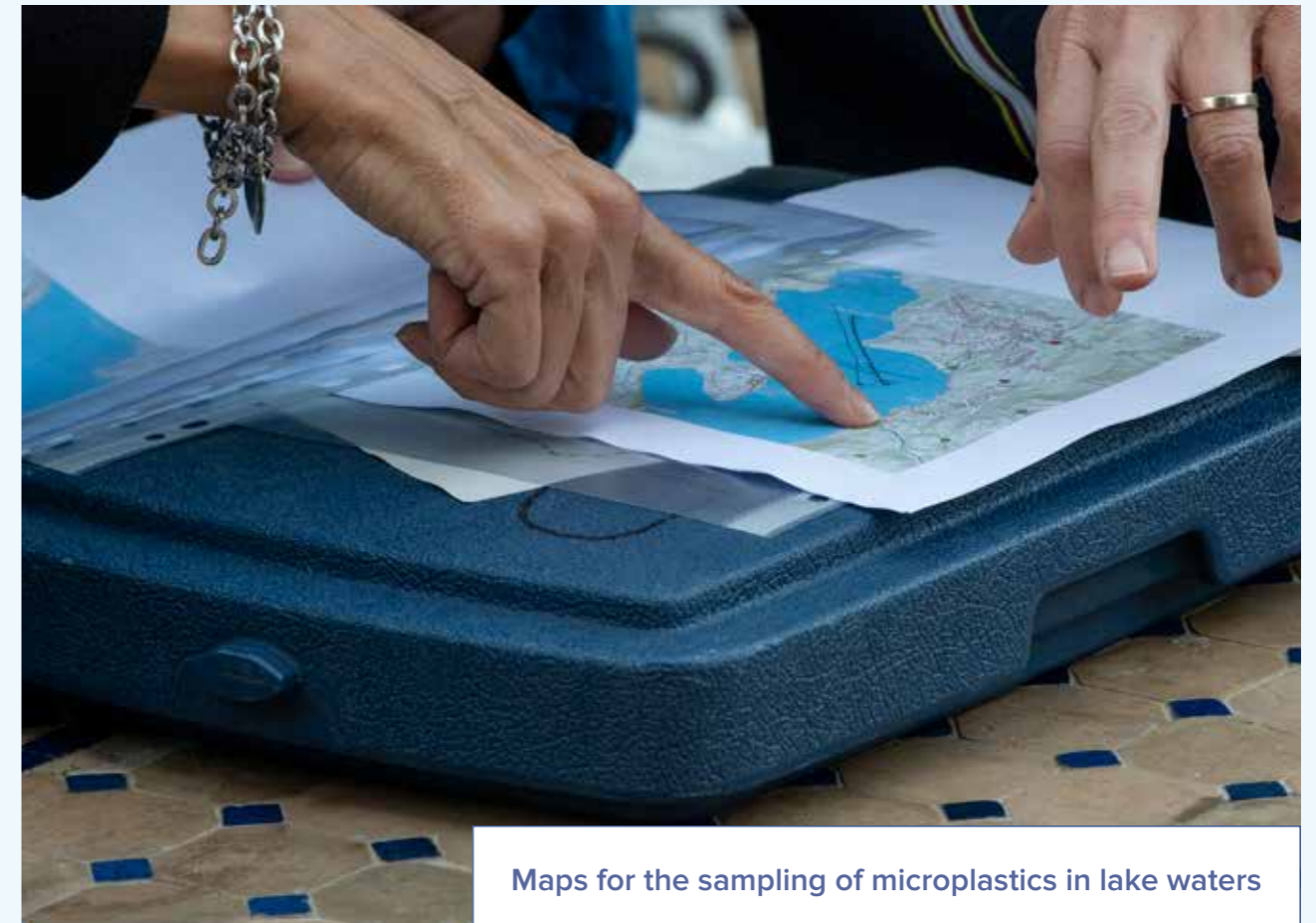
Maps for the sampling of microplastics in lake waters

were shared with over 150 operators and technicians in the water sector, environmental professionals and experts and public and private analysis laboratories, both Italian and German. The sessions were both theoretical and practical, directly aimed at the plants and university laboratories to also transfer the methods and knowledge acquired during the project.